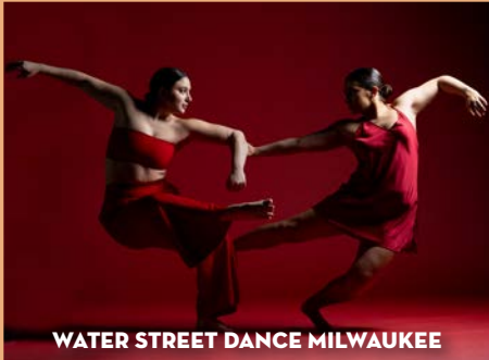
WATER STREET DANCE MILWAUKEE