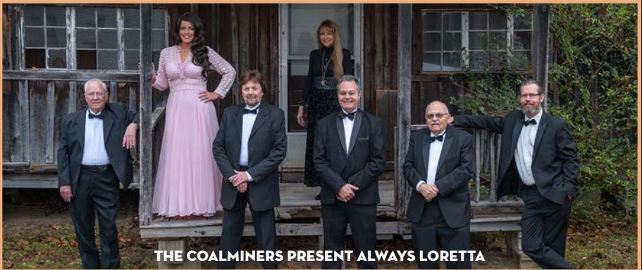
THE COALMINERS PRESENT ALWAYS LORETTA