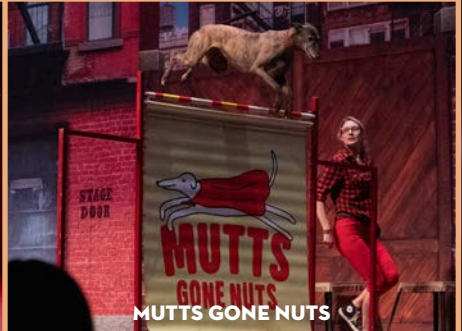
MUTTS GONE NUTS